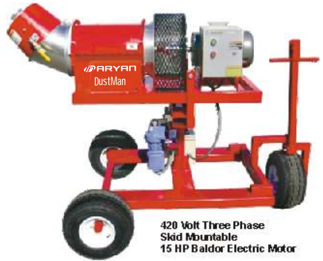
420 Volt Three Phase Skid Mountable 15 HP Baldor Electric Motor

In addition to dust control applications, the DustMan has also proven to be highly effective in controlling odor.