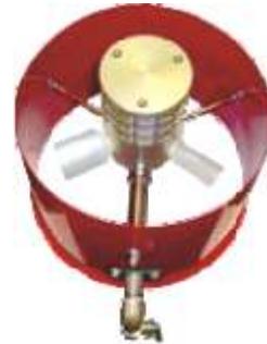
Automizing Nozzle is inset