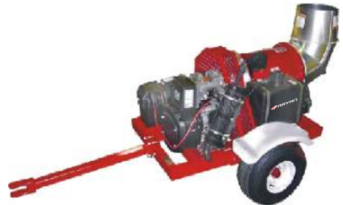
DustMan Diesel Shown as Debris Blower