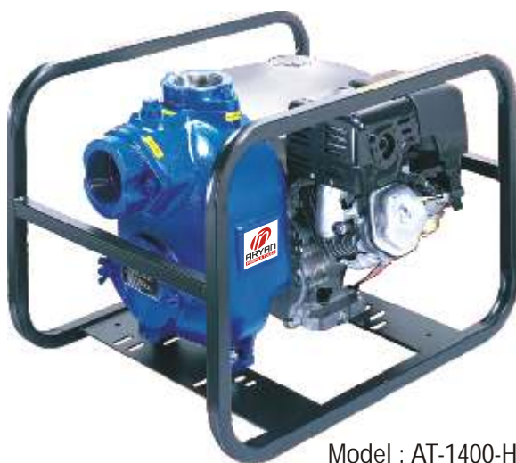
Model : AT-1400-H