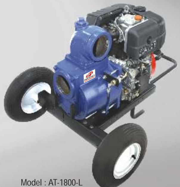
Model : AT-1800-L