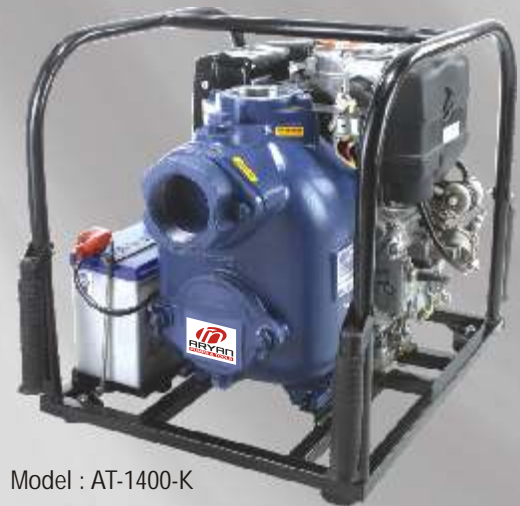
Model : AT-1400-K