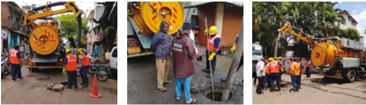
Working hard to better every situation!