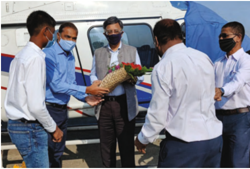
Mr. Baba Kalyani

Chairman and Managing Director of Bharat Forge, Kalyani Group